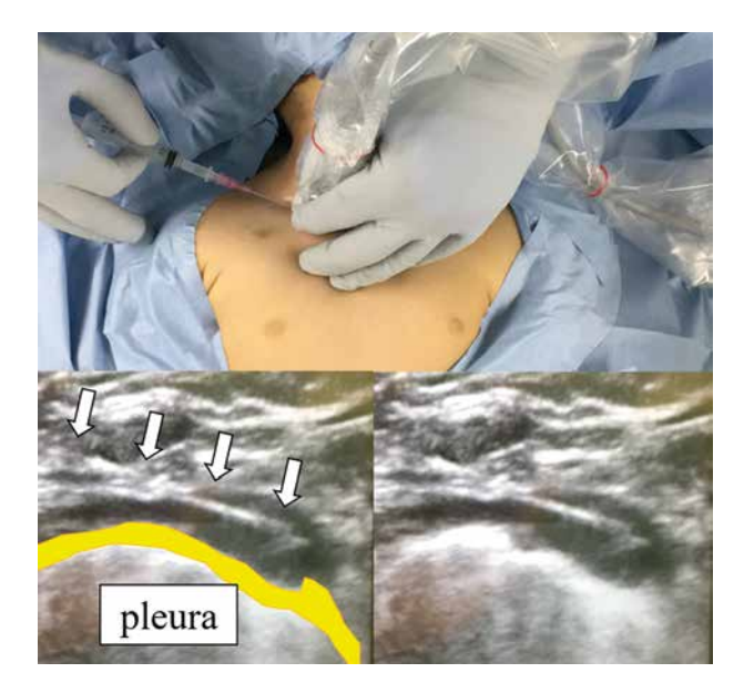
FIGURE 4. Real-time ultrasound-guided supraclavicular approach to the right brachiocephalic vein. The puncture needle (arrow) and its entire passage into the target brachiocephalic vein are visualised in a long-axis in-plane view during the puncture procedure via the real-time ultrasound-guided supraclavicular approach

in the subcutaneous tunnel as with the real-time ultrasound-guided infraclavicular axillary vein approach. The step-by-step procedures for realtime ultrasound-guided supraclavicular tunnelled Hickman/Broviac catheter implantation were introduced in our previous paper with figures and a video [5]. As shown in Figure 4, the puncture needle and its entire passage into the target brachiocephalic vein are visualised in a long-axis inplane view during the puncture procedure with the real-time ultrasoundguided supraclavicular approach. The brachiocephalic vein is larger than that of the internal jugular or subclavian vein because it is located more proximally than their confluence. In contrast, the axillary vein is smaller than the subclavian vein because it is located more peripherally [12]. The subcutaneous tunnel of the Hickman/Broviac catheter inserted via the supraclavicular approach passes over the clavicle [5]. To prevent accidental removal of the catheter during manipulation to create the subcutaneous tunnel and catheter fixation (a pitfall of the right supraclavicular approach for CVC or Hickman/Broviac catheter implantation), it should be noted that the CVC insertion depth via the right supraclavicular approach is significantly shorter than that of the right jugular vein or the left supraclavicular approach to locate the catheter tip at the carina level [6].