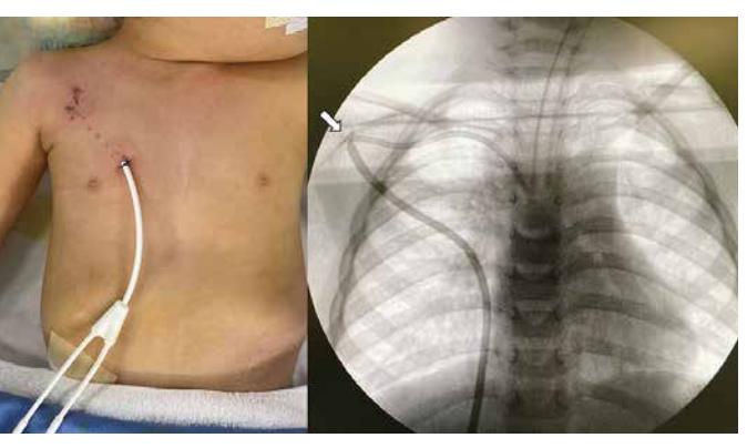
FIGURE 1. A Hickman catheter implanted via the right real-time ultrasound-guided infraclavicular axillary vein approach with a subcutaneous tunnel with its exit inside the ipsilateral nipple to obtain sufficient subcutaneous tunnel length. The chest X-ray shows that the calibre change portion of the Hickman catheter was positioned just at the sharp curve in the subcutaneous tunnel, and its lumen was bent and occluded (arrow)

Anestezjologia Intensywna Terapia 2021; 53, 3: 274–276